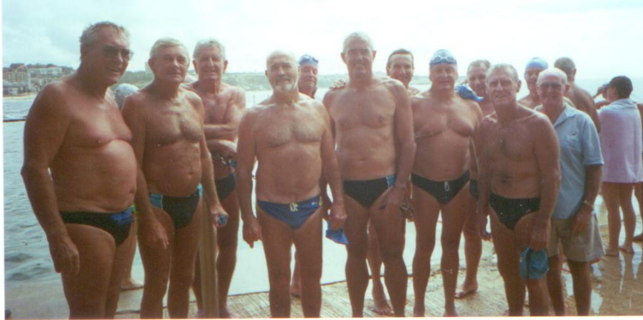
A fine body of men at Coogee