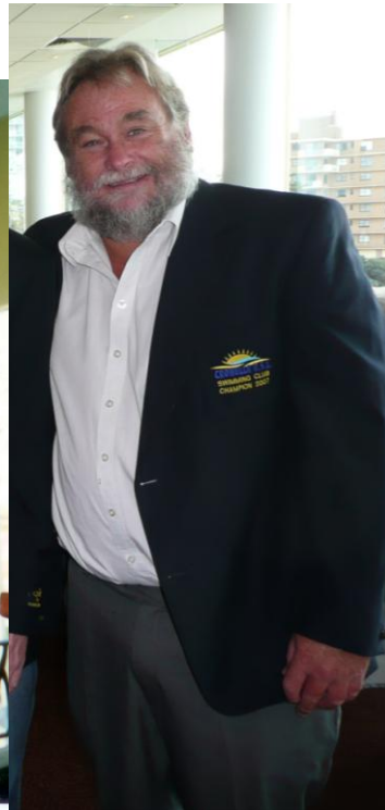
Tone Sheriff 2005/06-2007/08