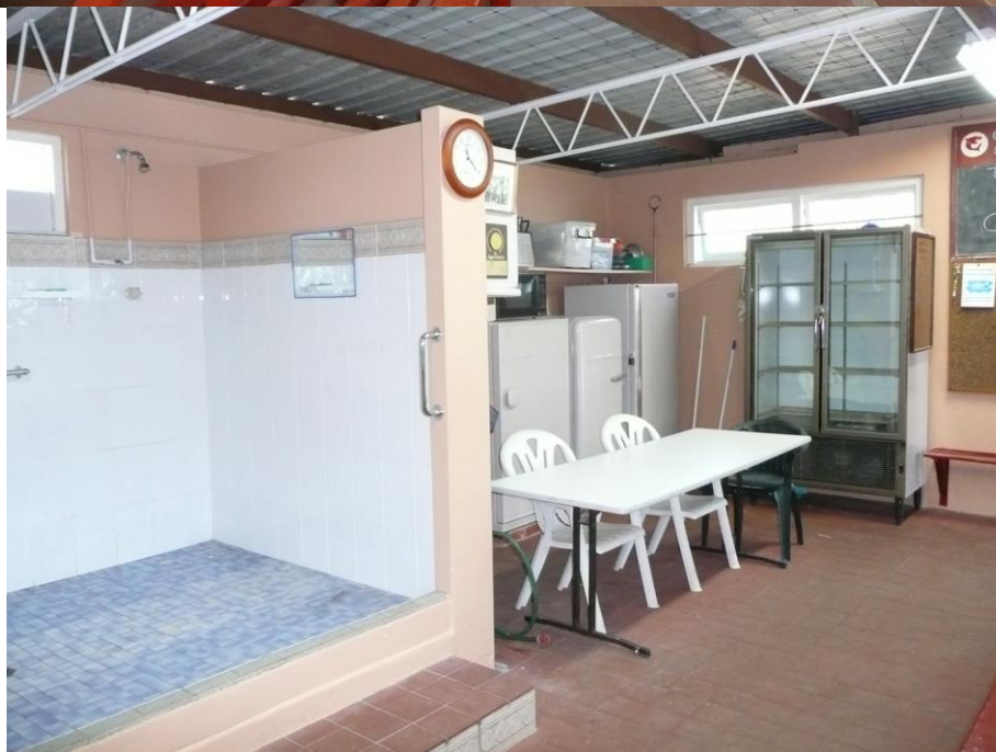
Views of the refurbished clubrooms