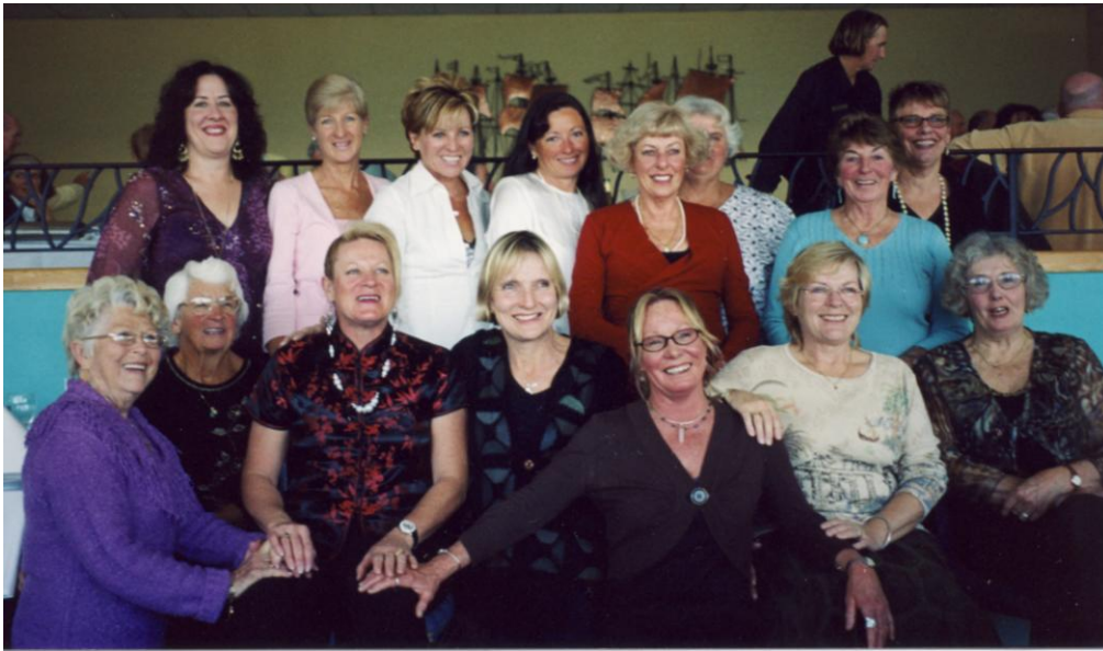
The Ladies 2006