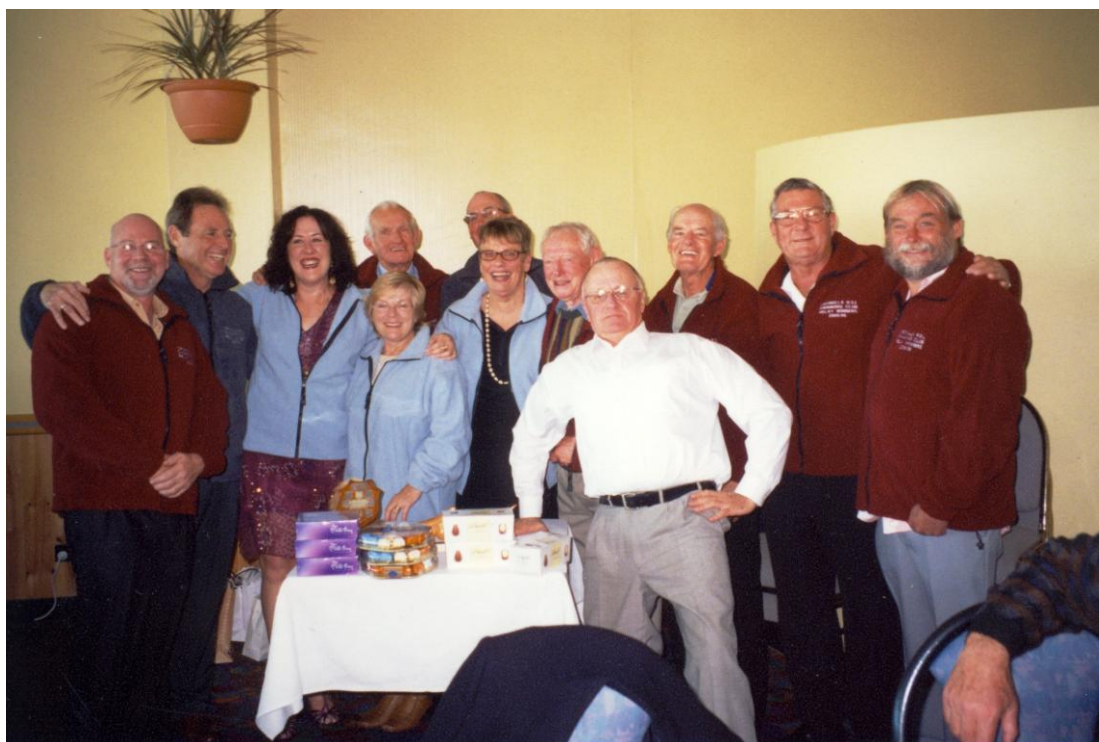
The winning Purple Hearts team with a few ring ins