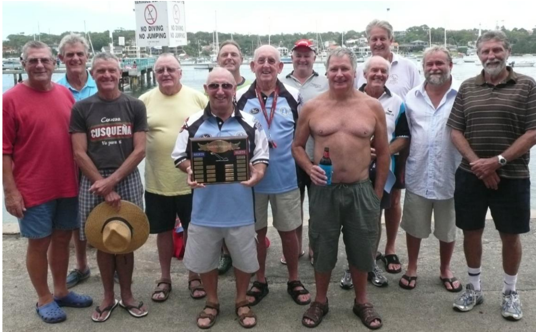
Proud members of the winning Shirts team