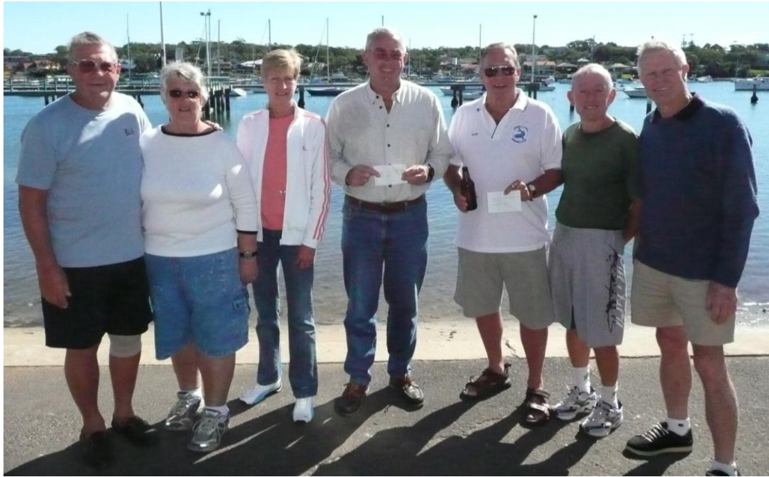
Some of the happy winners