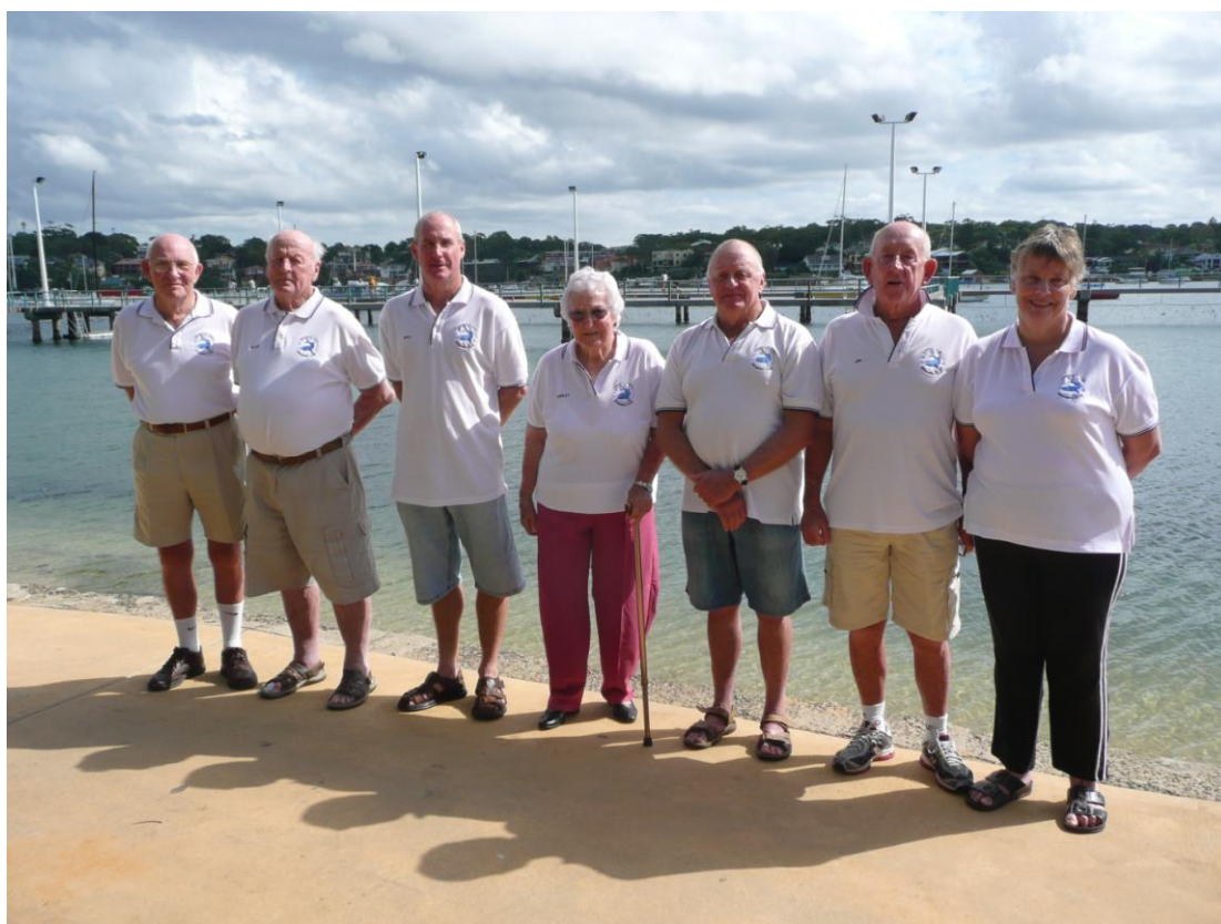
Life Members 2000 – 2010

Our sincere congratulations and thanks to our latest Life Members for your outstanding service and commitment to our Club.