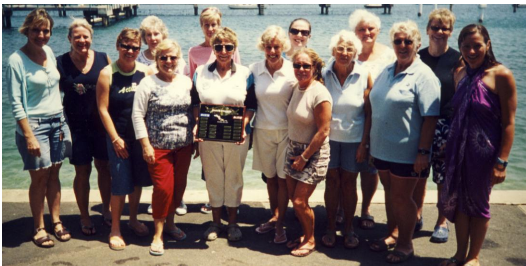
The 'Skirts' winning relay team