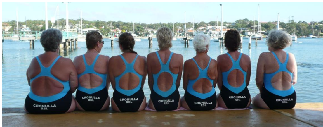
Some of our female members showing off their club costumes Recognise any?