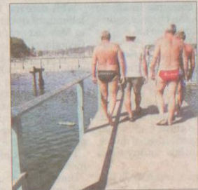
Big drop: Missing handrails at the baths make it easy for a child to fall in.

Mr Saunders said action had also been promised on the sand build-up at the southern end of the baths, which caused rubbish to collect along the pool netting and inhibited the natural tidal flushing.