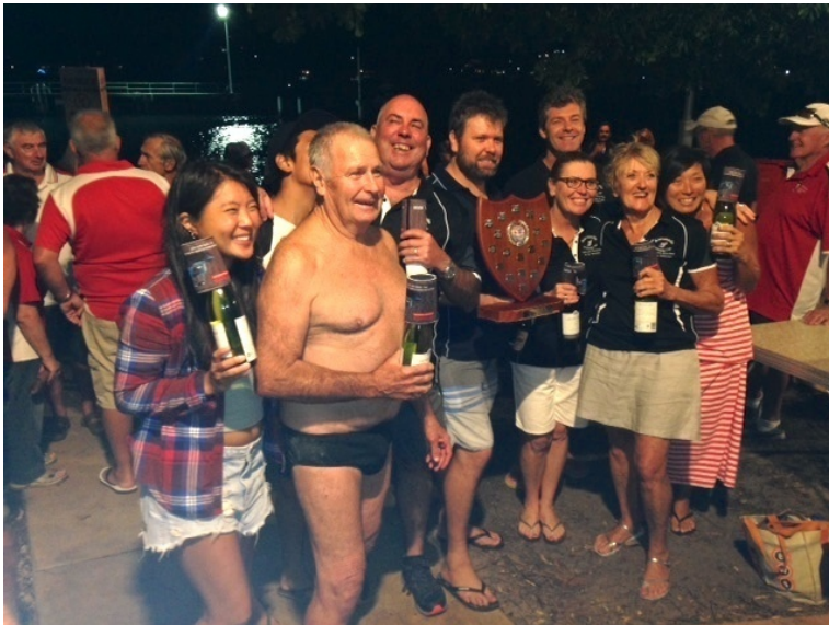
The winning Diggers Shield team, Kurranulla Black