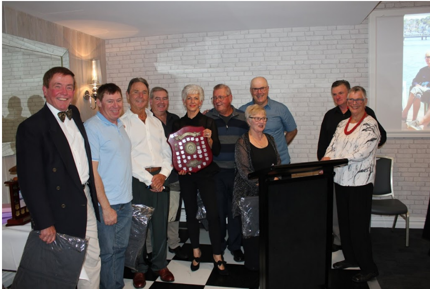
Sea Slugs winning relay team