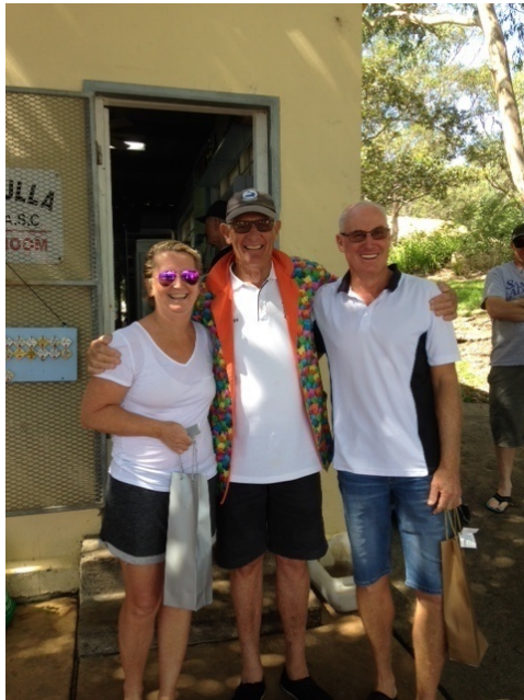
Our Race Secretaries also manage to win prizes.